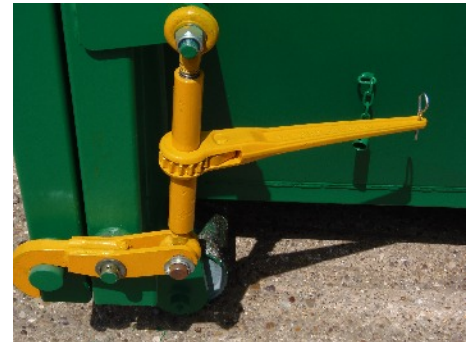
Pictured Above: The Door Lock Mechanism