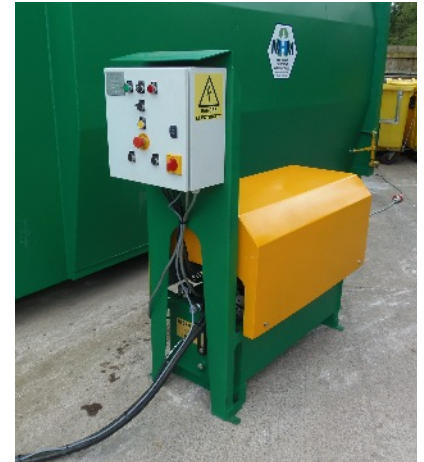
Pictured Above: The stand alone powerpack and control panel.