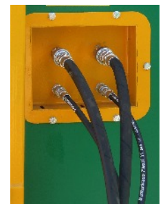
Pictured Right: Powerpack connection