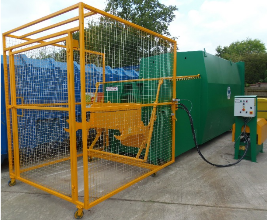
Pictured left: The 32yd portable compactor with stand alone powerpack and control panel. Installed on-site.